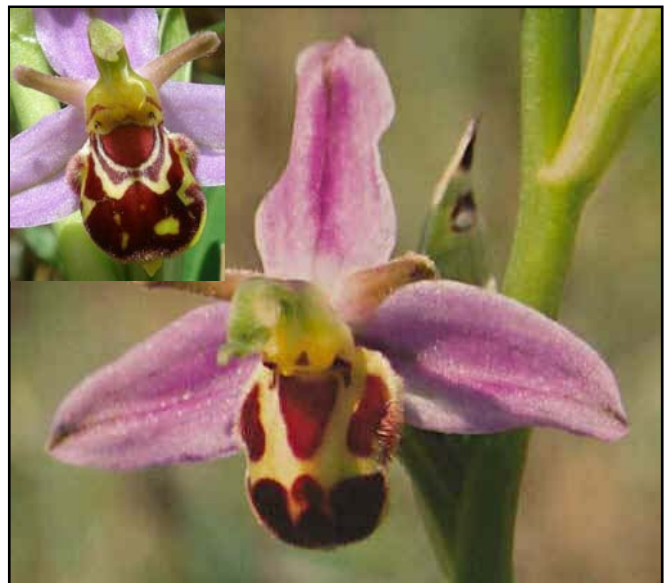
Bee Orchid ( Ophrys apifera var. belgarum )

A new find for Harlow this week! A local orchid expert Colin Metherell has discovered a new variety of Bee Orchid on some verges on the west side of Town. The common Bee Orchid is the smaller photo in the top left corner and has a different patterned "bee"!