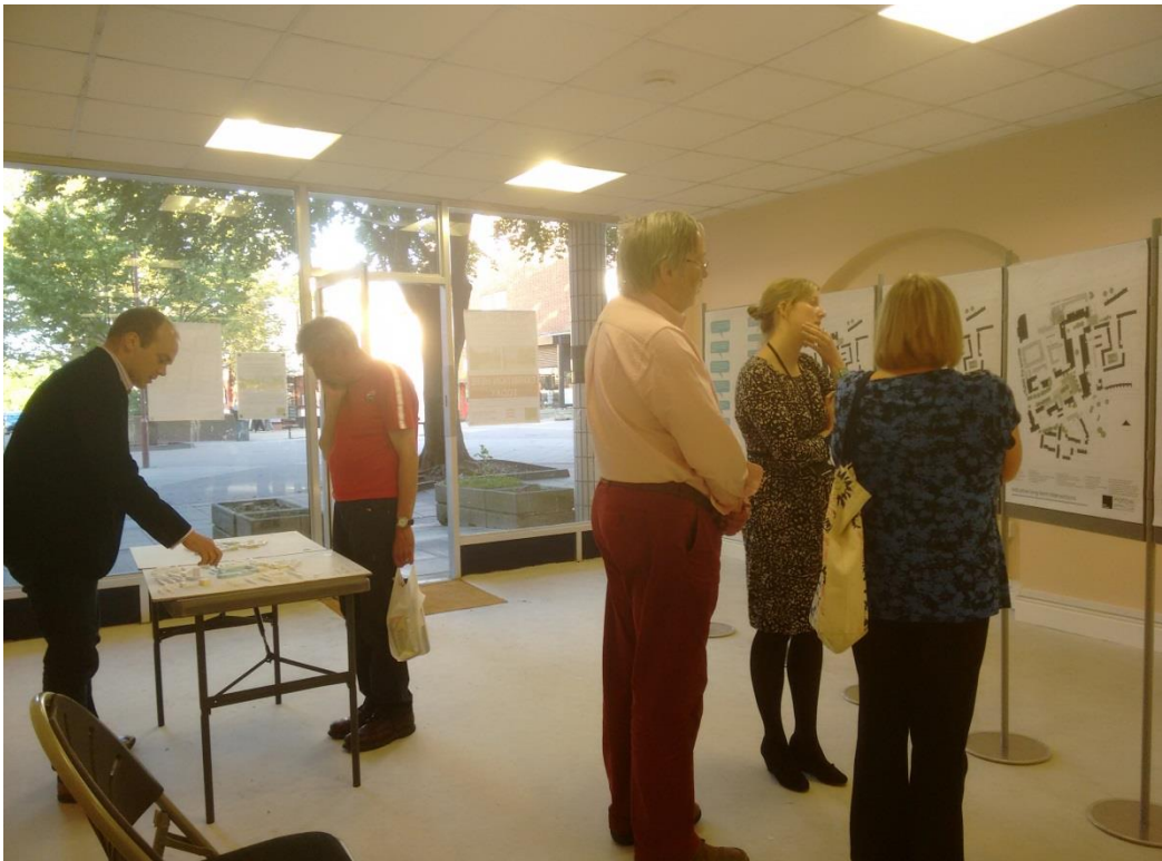
Representatives of Essex County Council and Harlow District Council discussing ideas with members of the public and local Councillors during the exhibition at 22 The Stow on 4 th June 2015.