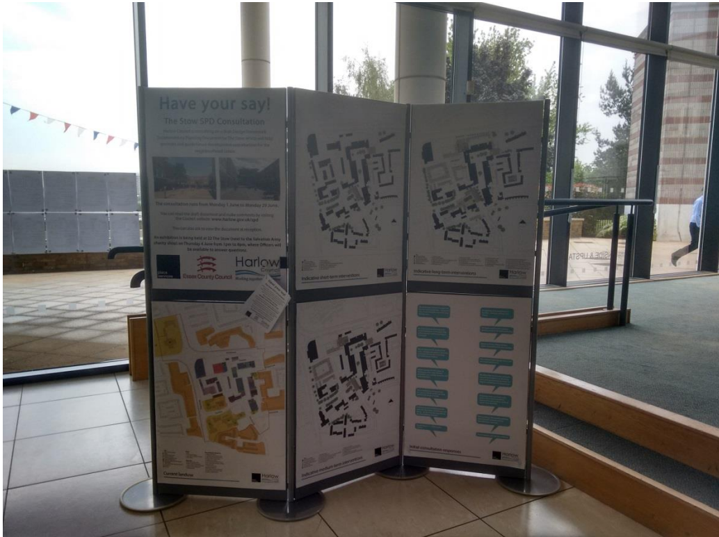
The un-manned exhibition which was in place in the Civic Centre reception between 05 and 29 June 2015.