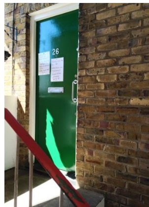
Frontage of Unit

Harlow Council has this rare opportunity of an office unit becoming available in the well run area of Wych Elm.