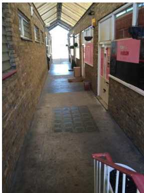
Passage Leading to Unit