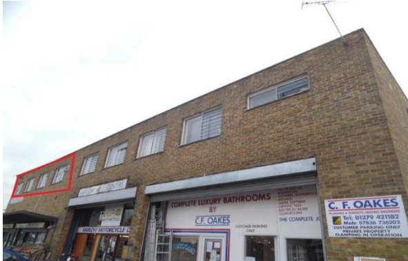
First Floor Unit