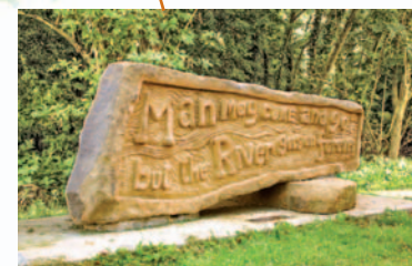
The Flowing River by Anthony Lysycia. 2008, Sandstone. Harlow Lock