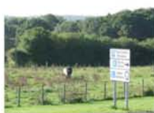
The natural environment (Green spaces)