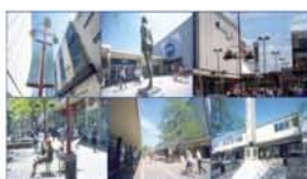
The built environment