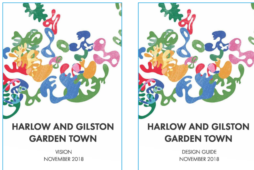
Figure 2 Harlow and Gilston Garden Town Vision and Design Guide

The East-West and North-South Sustainable Transport Corridors are a key element of the infrastructure required to integrate the Garden Town Communities with the built-up area of Harlow and achieve the aim to make walking, cycling and public transport the most attractive option in line with Garden City Principles. A Draft Transport Strategy has been produced for consultation setting out objectives for achieving sustainable travel and a Sustainable Transport Corridor Study for the Garden Town has been produced to set out the design and scope of the corridors, and further detailed work is ongoing.