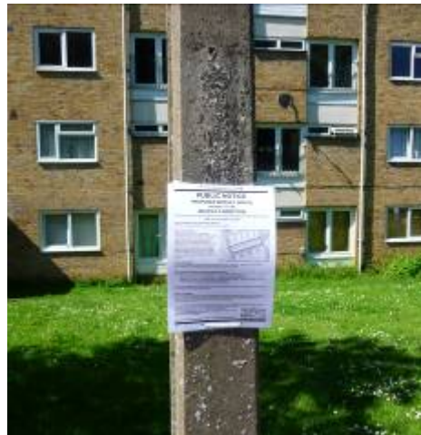
Site notices outside 1 to 56 Morley Grove (photos taken 25th May 2012)