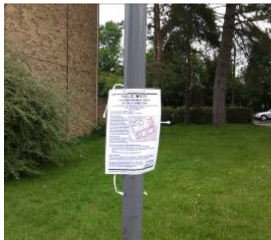
Site notices outside 57 to 99 Morley Grove (photos taken 23rd May 2012)