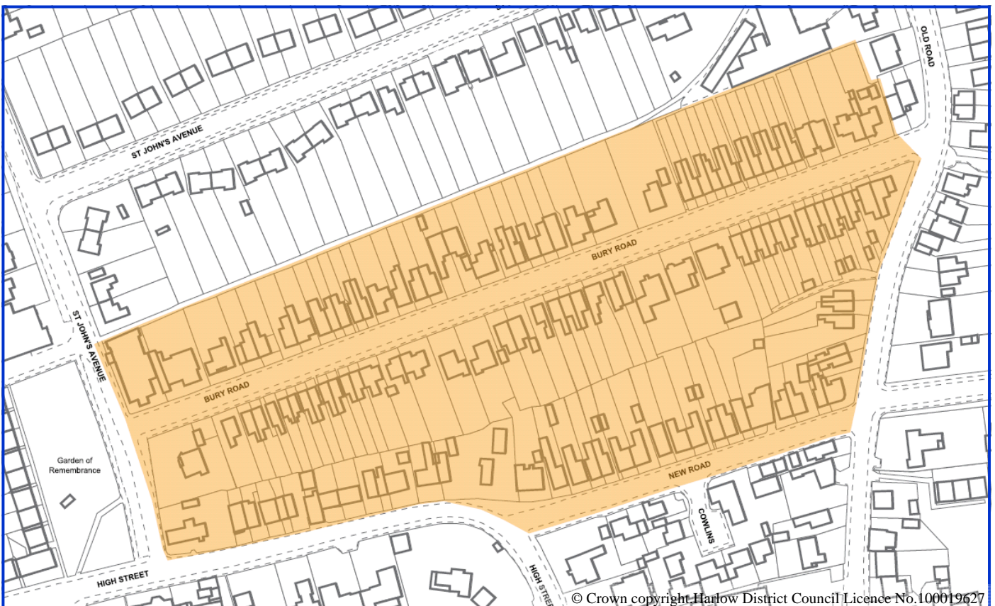
Article 4 Direction Area