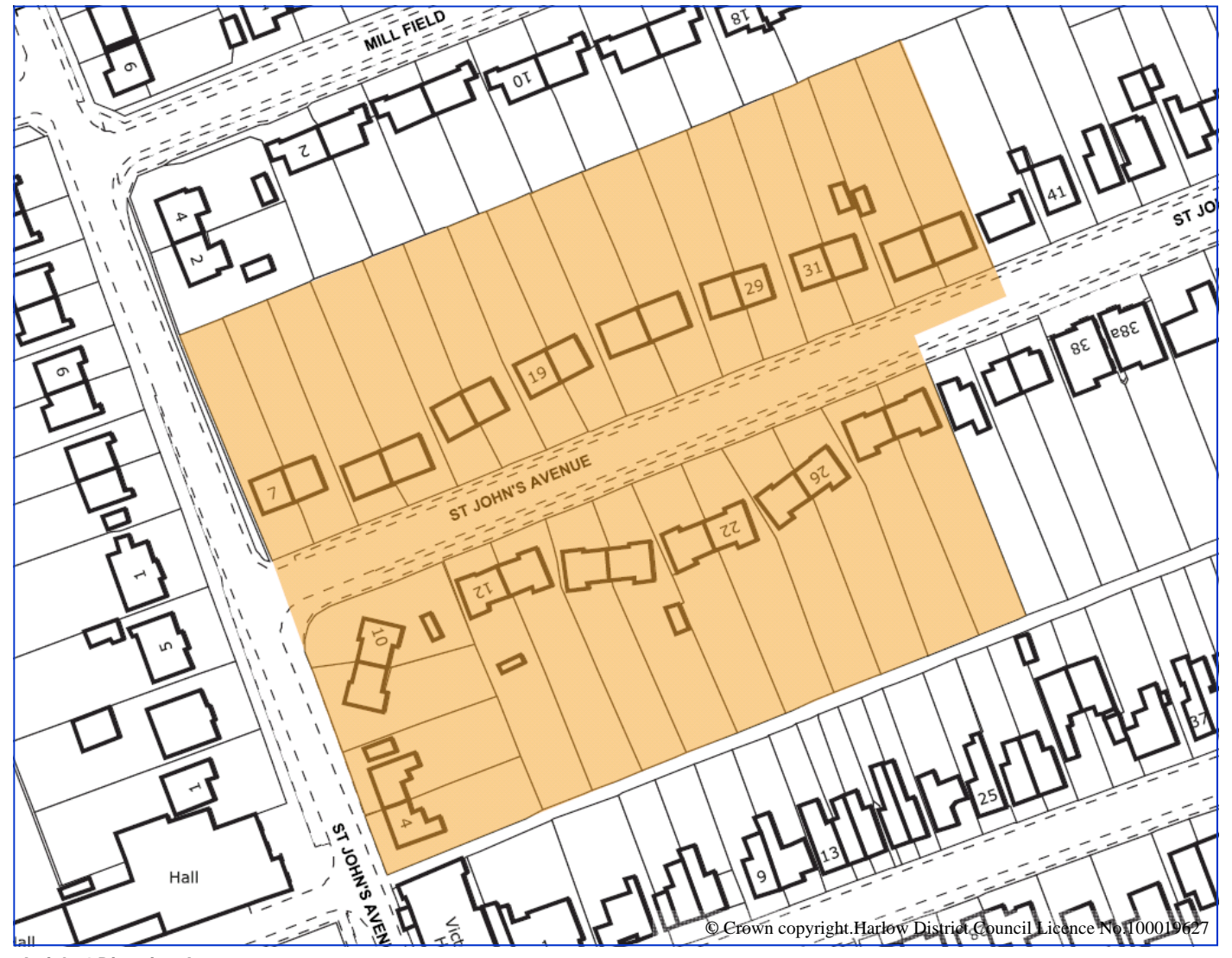
Article 4 Direction Area